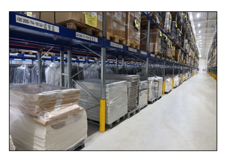
Relief supplies are collected in the central THW logistics centre in Hilden (DE)

The logistics network can be deployed reliably and sustainably thanks to its embedding in the EU's Civil Protection Mechanism (UCPM). The initiative supplements measures taken as part of the Netzwerk Kulturgutschutz Ukraine, which was established by the Federal Government Commissioner for Culture and Media in association with the Foreign Office. The work of the DAI and KGR is supported by the Federal Foreign Office.