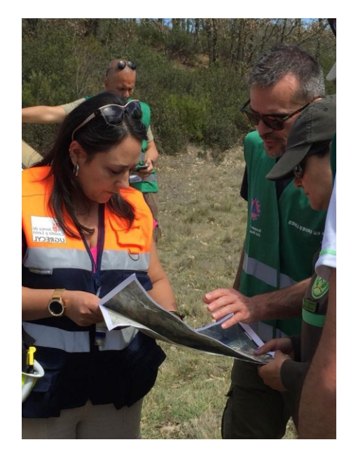
Field activities at EUMODEXLEON22

From 9 to 12 May, EUMODEXLEON22<sup>4</sup>, an international field exercise focusing on forest fires, took place in the Autonomous Region of Castilla y León and represented another valuable opportunity to share the expected results of PROCULTHER-NET as well as to test operational procedures for the safeguard of cultural heritage in emergency.