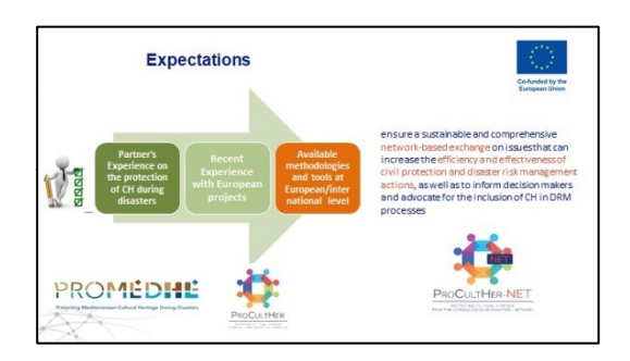
A snapshot of PROCULTHER-NET background experience

From the very beginning of project activities, the PROCULTHER-NET Community is fully working on creating synergies with other initiatives carried out in the field of the protection of cultural heritage at risk. Here below the networking and advocacy activities undertaken by the project and its partners