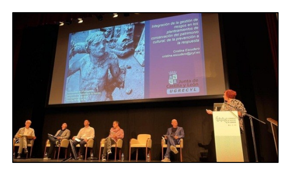
Ms Escudero talking at the Congress

In order to ensure an effective coordination system for preventing and better facing forest fires, the Junta de Castilla y León maintains active and tests periodically the protocols and collaboration agreements with border regions and with Portugal in fire emergencies, as well as with different institutions and organisations at all governance levels, e.g., MITECO, the Spanish Military Emergencies Unit - UME, town councils, provincial councils, etc.