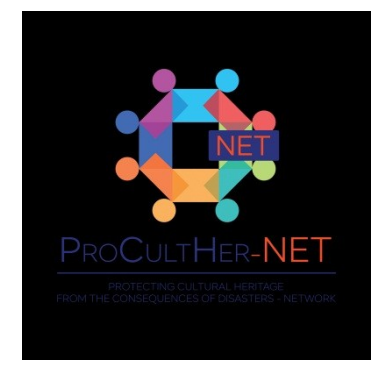
PROCULTHER-NET logo black

To establish a European thematic community, within the Union Civil Protection Knowledge Network, focused on the protection of cultural heritage at risk of disaster, gathering and involving the largest number of actors and stakeholders active in the field, through a multidisciplinary approach to enhance cooperation and to support and complement the effort made at European level.