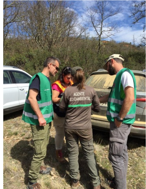
Field activities at EUMODEXLEON22

The exercise was carried out on an unprecedented scale for the Region, in an area located between the towns of Astorga and Tabuyo del Monte, in the province of León, and gathered a total of approximately 400 participants, in addition to 10 fire engines, 4 airborne resources, 4 drones and 30 light vehicles, the PMA (Advanced Command Post) and associated logistical teams. From the European Union side, 4 UCPM ground modules (2 Portuguese, 1 Greek and 1 French), 1 Italian air force module and 1 Croatian drone module joined the exercise to test procedures and interoperability of the forces displayed on the field.