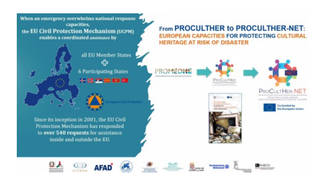
The evolution from PROCULTHER to PROCULTHER-NET in a slide

The Ministry of Culture of Italy convened, in coordination with the French Presidency of the European Union, the Conference of the Ministers of Culture of the Euro-Mediterranean region, the first Culture Ministerial meeting of the EU-Southern Partnership. The conference was hosted by the city of Naples, on 16 - 17 June 2022, and was held in hybrid format (in-presence and virtual).