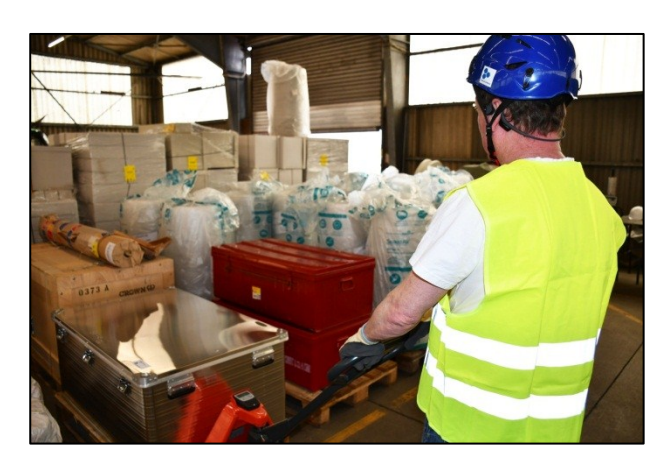
Packaging and aid materials are collected in Germany to support the protection of Ukrainian cultural heritage

In June 2022, 165 pallets of packaging and aid materials are shipped to Ukraine through the logistic network set up by KulturGutRetter (KGR), the German Archaeological Institute (DAI) and the Federal Agency for Technical Relief (THW) – both PROCULTHER-NET project partners – to protect highly endangered museums, archives, libraries and monuments.